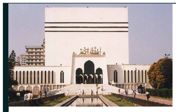
BAITUL MUKARRAM, THE NATIONAL MOSQUE OF BANGLADESH, DHAKA

IT SEEMED THAT URDU-SPEAKERS, AN INTELLECTUAL ELITE AND POPULATION MINORITY, WERE IMPLICITLY DECLARING THEIR CULTURE AS SUPERIOR