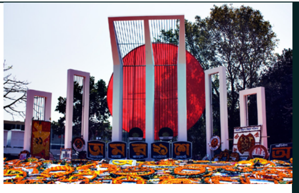
THE SHAHEED MINAR (MARTYR'S COLUMN) AT DHAKA UNIVERSITY, BANGLADESH

IT BECAME INCREASINGLY APPARENT THAT PAKISTAN'S NATIONAL IDENTITY PREDICATED ON RELIGIOUS COMMONALITY WAS INSUFFICIENT FOR UNIFYING THE