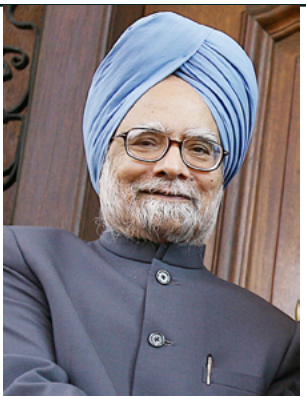
MANMOHAN SINGH, PRIME MINISTER OF INDIA

we are becoming a global village, we should be strengthening village councils rather than weakening them. One of the things I do in the book is to give away a "dirty little secret". What is this secret? It is that it has been the consistent policy of the Western world, led by the USA, to keep global village councils weak. That is why the UN is kept weak; why UN specialized agencies are kept weak, and why they are not functioning. Now, this may have made sense when the West was completely dominant, and would have had no need for village counsels. But today the world is changing so quickly that the West has to rethink what its policy should be.