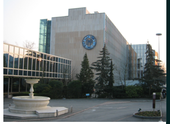
THE WORLD INTELLECTUAL PROPERTY HEADQUARTERS IN GENEVA, SWITZERLAND

ATTEMPTING TO RE-CLASSIFY ALREADY DISCLOSED DOCUMENTS IS ESSENTIALLY FUTILE, AS THE INITIAL ACTION CANNOT BE REVERSED