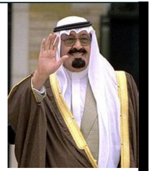
KING ABDULLAH OF SAUDI ARABIA

MOST POPULAR ARE HASHTAGS DENOTING DISGUST WITH THE REGIME, INCLUDING "SAUDI CORRUPTION" AND "POLITICAL PRISONERS"